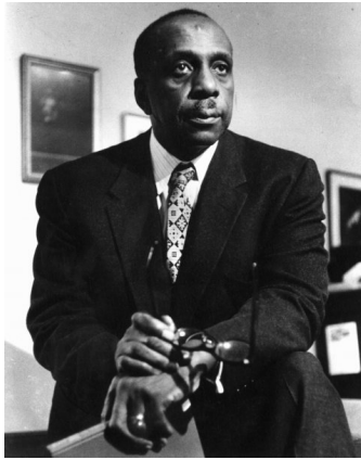
Dr. Howard Thurman.