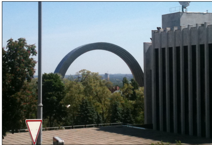
Kiev Friendship Arc, Ukraine.

T wenty years ago Ukraine gained its independence and started its path towards a free market economy and democratic governance. Where is it now after the change of four presidents and the Orange Revolution? According to the Freedom House Annual Report in 2011, on a scale of 1 to 7, with 1 representing the highest level, civic society in Ukraine scored at 2.75, democracy scored 4.61, and corruption scored 5.75. The Report further states that national political power in Ukraine is consolidated in the hands of President Yanukovich, who regained control over the cabinet, the security service, and the