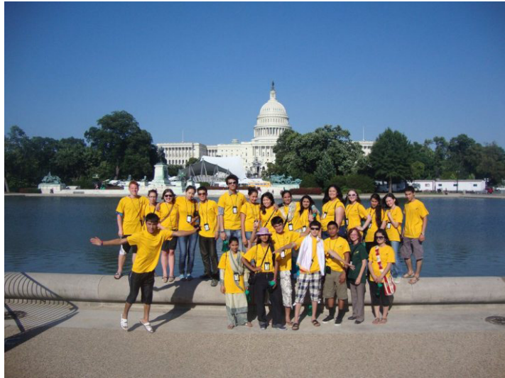
Benjamin Franklin Summer Institute Students in Washington, DC.